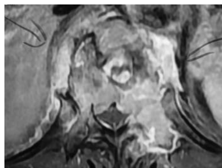
Extensive metastasis at T11 with cord compression T11 metastasis

Surgical approaches may be anterior or posterior. Sometimes a combination of both approaches is necessary. Surgery is needed if patient presents with deteriorating neurological deficit due to spinal cord compression, or when there is imminent risk of pathological vertebral fracture. Radiotherapy or chemotherapy may not be able to remove fast enough the tumour compressing the cord. They also can not address the pain arising from spinal instability due to pathological fracture. Speedy surgical decompression is needed in such circumstance to preserve the spinal cord function. Following surgery, patient will have good pain relief and can be treated with chemotherapy or radiotherapy without fear of losing the neurological function.