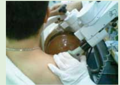
Ultrasound-guided treatment for Shoulder Tendinosis

An ESWT session is usually carried out as an outpatient procedure, taking about 20 minutes per site. The injured structure is first identified, and then precisely targeted by the ESWT device by means of real-time ultrasound guidance. Shock-waves are then delivered in rapid succession, ramping up from low levels to therapeutic levels. In most cases, over 2000 shocks will be used per session.