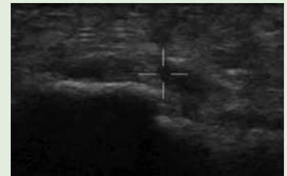
Ultrasound-guided ESWT Treatment for Plantar Fasciitis

For most conditions, 1 to 3 sessions would be recommended. The interval between sessions may vary from 4 days to several weeks.