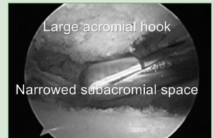
Using a bone burr to remove the acromial hook

In an arthroscopic (keyhole) procedure, two or three small puncture wounds are made. The joint is examined through a fiberoptic scope connected to a television camera. Small instruments are used to remove bone and soft tissue to "decompress" the space.